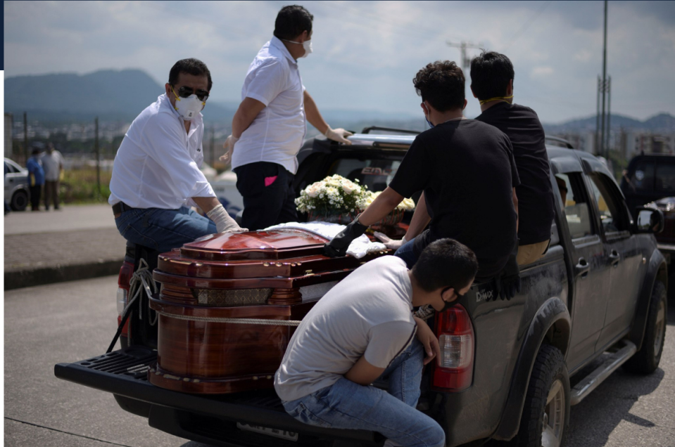
People wait next to a coffin in a pick-up truck lined up outside of a cemetery as Ecuador’s government announced on Thursday it was building a “special camp” in Guayaquil for coronavirus disease (COVID-19) victims, in Guayaquil, Ecuador, on April 2, 2020.

“At the cemetery, they will be buried person by person, without cost to the families,” says the government’s coordinator handling the country’s coronavirus deaths.